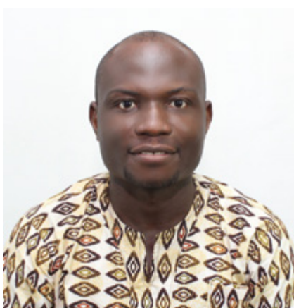
HSWT's postgraduate training course "Food Chains in Agriculture" is oriented towards the establishment, improvement and management of value chains in the agriculture and food sectors